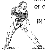
IN THE FIELD

Inning by inning the scorekeeper will credit the positions shown 1 thru 10 with put-out, assist or errors, noting any fielding changes by filling in the double line separating each inning.