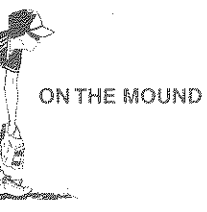
ON THE MOUND

RECORDING NUMBER OF INNINGS PITCHED. By inning the scorekeeper writes in the uniform number of the pitcher on the mound.